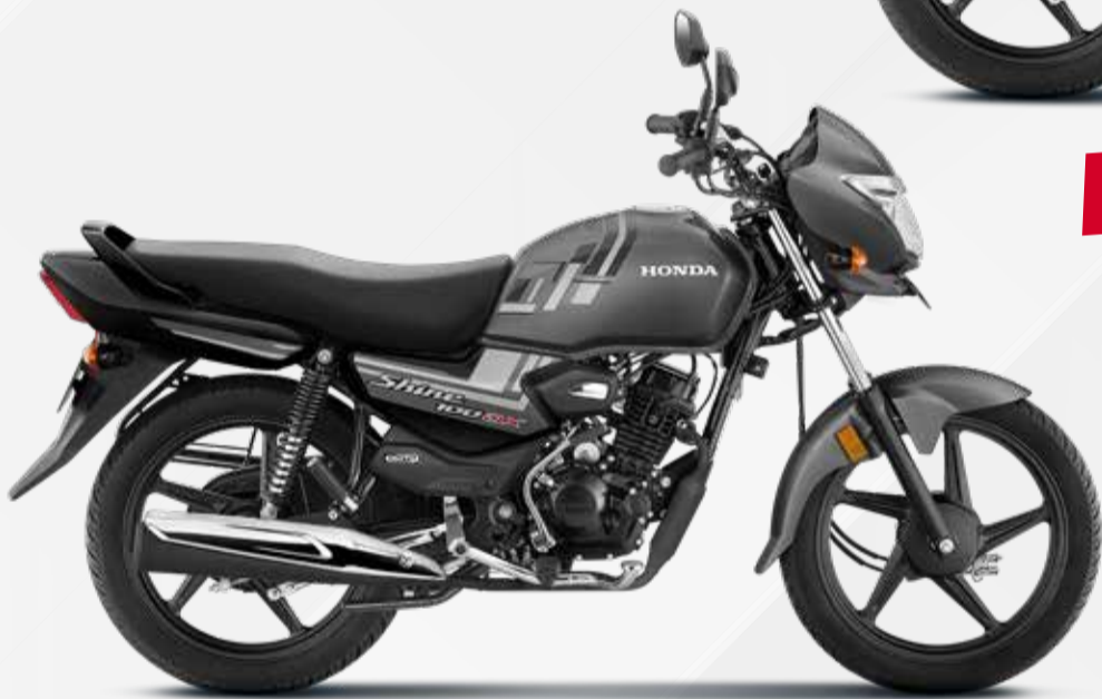
GENY GRAY METALLIC